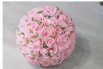
Step 2: Merge