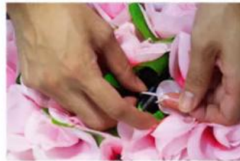
Step 3: Recommended reinforcement with zip ties