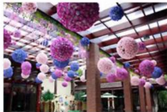
Step 4: Installation completed